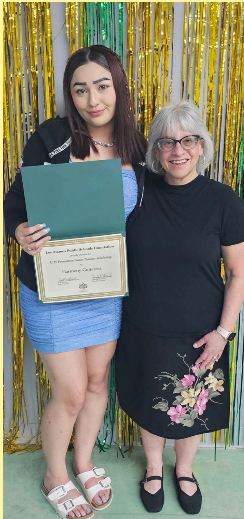
College: New Mexico Highlands University Major: Education